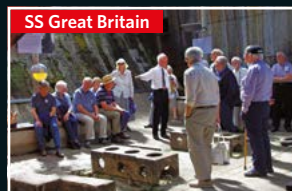
SS Great Britain