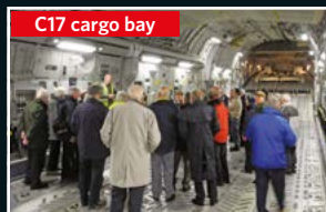
C17 cargo bay