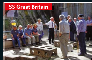
SS Great Britain